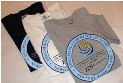
T-Shirt 100% cotton navy blue, sports grey or white Sizes S, M, L, XL, 2XL. $15.00