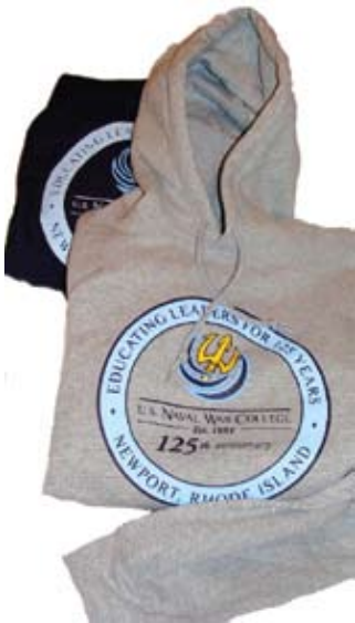
Hooded Sweatshirt 50% polyester, 50% cotton navy blue or sports grey Sizes S, M, L, XL, 2XL. $40.00

We are celebrating the NWC's 125th Anniversary with these special items and more! Show your school pride!