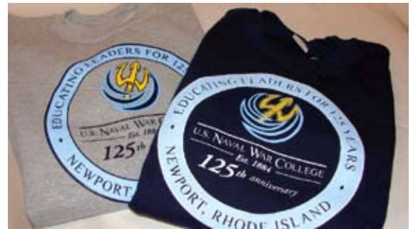
Crew Neck Sweatshirt 50% polyester, 50% cotton navy blue or sports grey Sizes S, M, L, XL, 2XL. $30.00