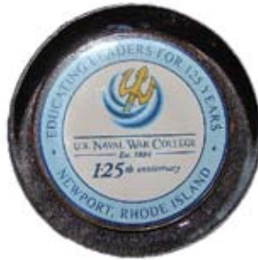
Glass Paperweight 3" in diameter & 1" high $18.00