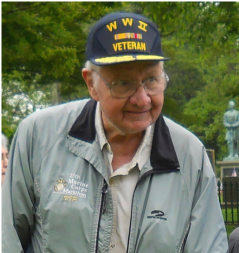
J. WILLIAM MIDDENDORF, former Secretary of the Navy and NWCF Trustee Emeritus, recently published "The Great Nightfall: How We Win the New Cold War," in which he examines the threats and challenges to America from a rising China and other adversaries. The following is an excerpt from the book.