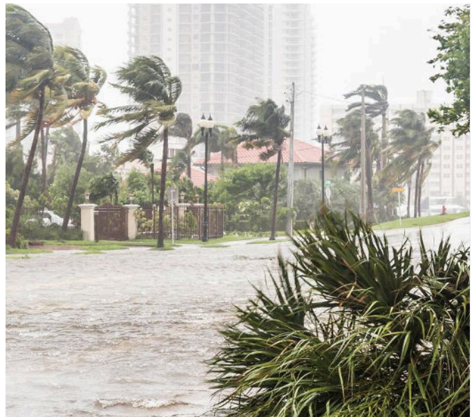
There is evidence that climate change is making hurricanes stronger and more destructive.

U.S. allies, partners, and competitors are assessing the implications of climate change on their respective strategic objectives. Malign actors may try to exploit regional instability exacerbated by the impacts of climate change to gain influence or for political or military advantage. Global efforts to address climate change – including actions to address the causes as well as the effects – will influence DoD strategic interests, relationships, and priorities. Cooperation with international partners to address the security implications of climate change can strengthen alliances and partnerships. Building awareness of how other nations are preparing for climate change is critical to understanding the risks and opportunities across strategic, operational, and tactical environments.