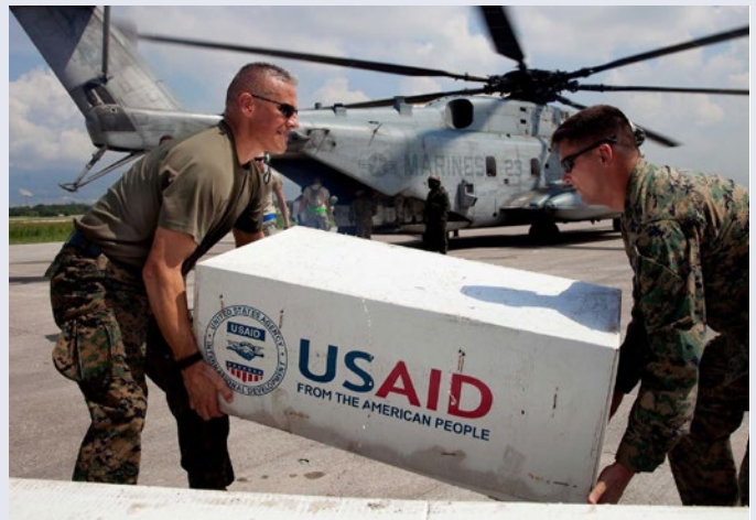
DoD supports the US Government Assistance to Haiti after Hurricane Matthew in 2016.