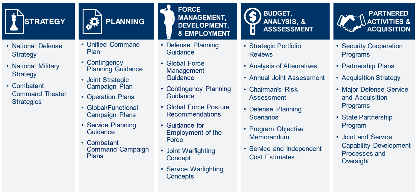
Figure 3. Examples of DoD documents in which climate will be incorporated.

Strategic documents signed by the Secretary or other senior DoD leaders guide DoD Components, formalize priorities to direct resource allocation, and drive action to accomplish desired ends. As required by EO 14008, Section 103(d), DoD will incorporate climate considerations into the National Defense Strategy (NDS); Defense Planning Guidance (DPG); the Chairman’s Risk Assessment; and other relevant strategy, planning, and programming documents and processes. A report on progress of this integration is due annually to the National Security Council starting in January 2022. Climate change will be integrated into several of these documents through the office of the Assistant Secretary of Defense for Strategy, Plans, and Capabilities under the USD(P). In addition to the guidance in EO 14008, Section 103(d), DoD will also include consideration of climate across all relevant strategy, planning, force management, force employment, force development, and budget documents as discussed below and summarized in Figure 3.