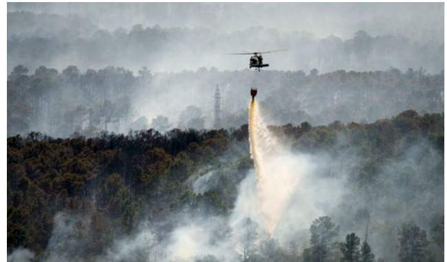
A Texas Army National Guard UH-60 Black Hawk helps fight wildfires.

The CPG addresses preparation and review of contingency and campaign plans, including homeland defense and military support to civil authorities. The 2021 CPG includes prioritization of severe weather challenges to war plan development, and future CPGs will include consideration of other aspects of climate change.