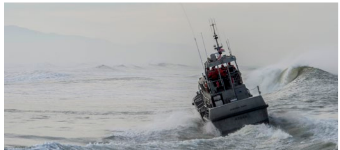
Coast Guard crews train in high surf to ensure they are prepared to respond to any maritime emergency during rough weather conditions.

scientific information at time scales required for DoD strategy and planning. DoD will validate its selection and use of climate data and projections internally and through consultation with scientific agencies and other partners such as DoD's Climate Working Group, DoD's Strategic Environmental Research and Development Program (SERDP), Federally Funded Research and Development Centers (FFRDCs), and the U.S. Global Change Research Program (USGCRP)—(of which DoD is a member)—within the White House Office of Science and Technology Policy (OSTP). DoD will continue to review and assess how to integrate climate science, data, and scenarios into Department documents and processes.