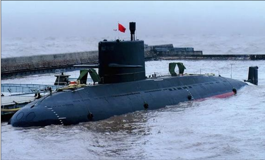
Figure 7. Yuan (Type 039) Attack Submarine (SS)