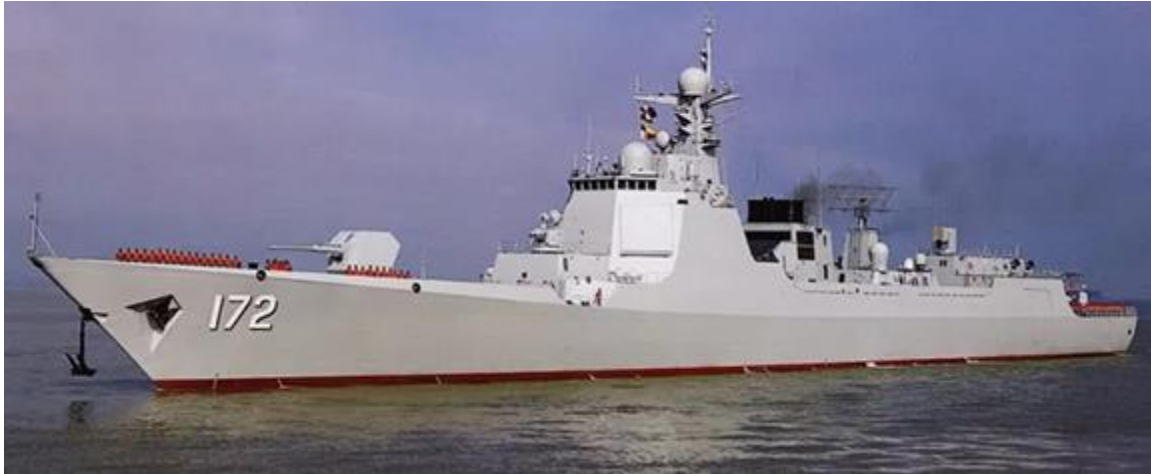
Figure 17. Luyang III (Type 052D) Destroyer