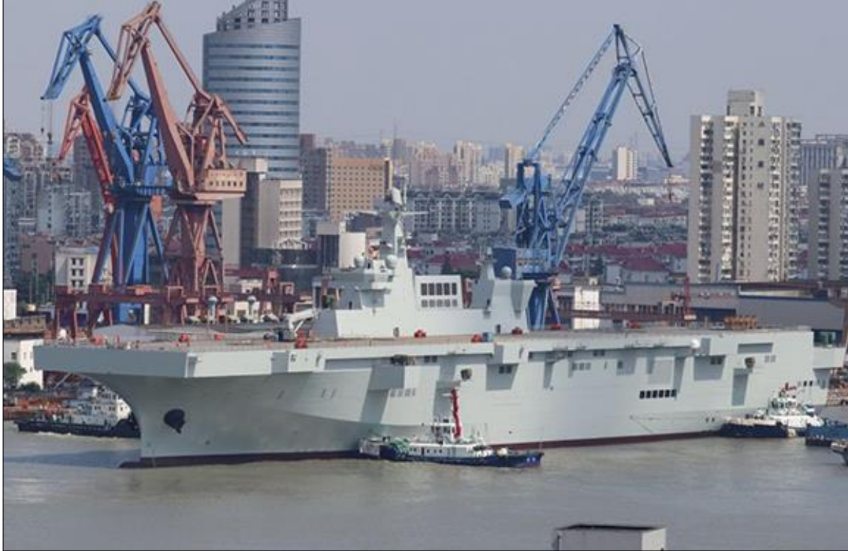
Figure 21. Type 075 Amphibious Assault Ship