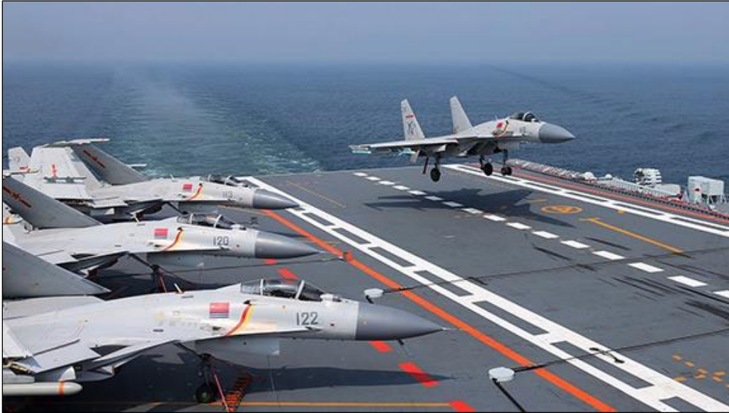
Figure 13. J-15 Flying Shark Carrier-Capable Fighter