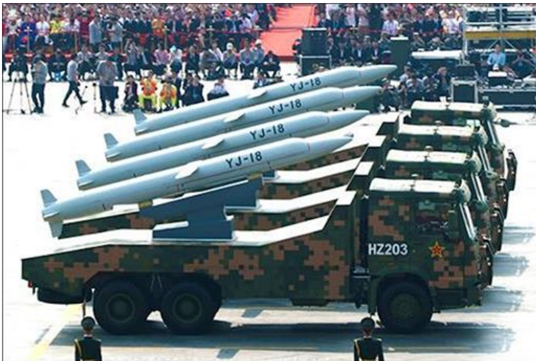
Figure 4. Reported Image of Anti-Ship Cruise Missile (ASCM)

Source: Photograph accompanying “YJ-18 Eagle Strike CH-SS-NX-13,” GlobalSecurity.org, updated October 1, 2019. The article states “A grand military parade was held in Beijing on 01 October 2019 to mark the People’s Republic of China’s 70 th founding anniversary.... One weapon featured was a new generation of anti-ship missiles called YJ-18. China unveiled YJ-18/18A anti-ship cruise missiles in the National Day military parade in central Beijing.”)