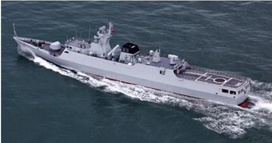
Figure 19. Jingdao (Type 056) Corvette