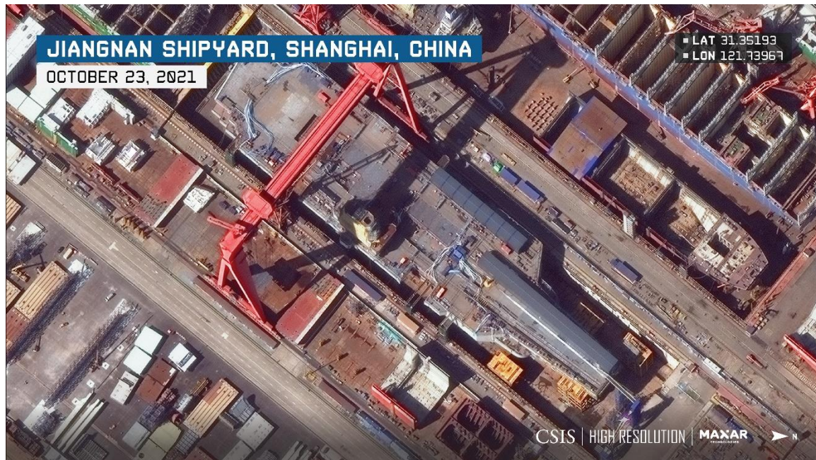
Figure 12. Type 003 Aircraft Carrier Under Construction