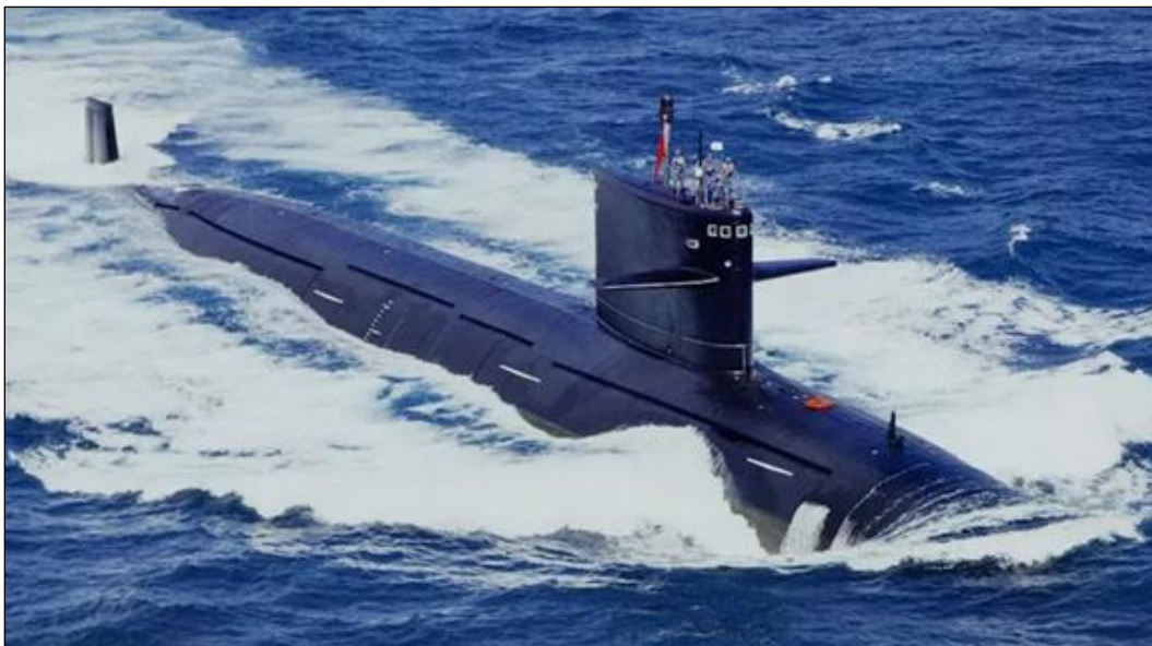
Figure 8. Shang (Type 093) Attack Submarine (SSN)