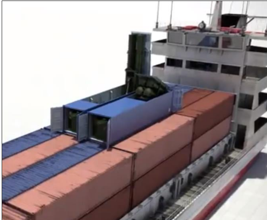
Figure 6. Illustration of Reported Potential Containerized ASCM Launcher