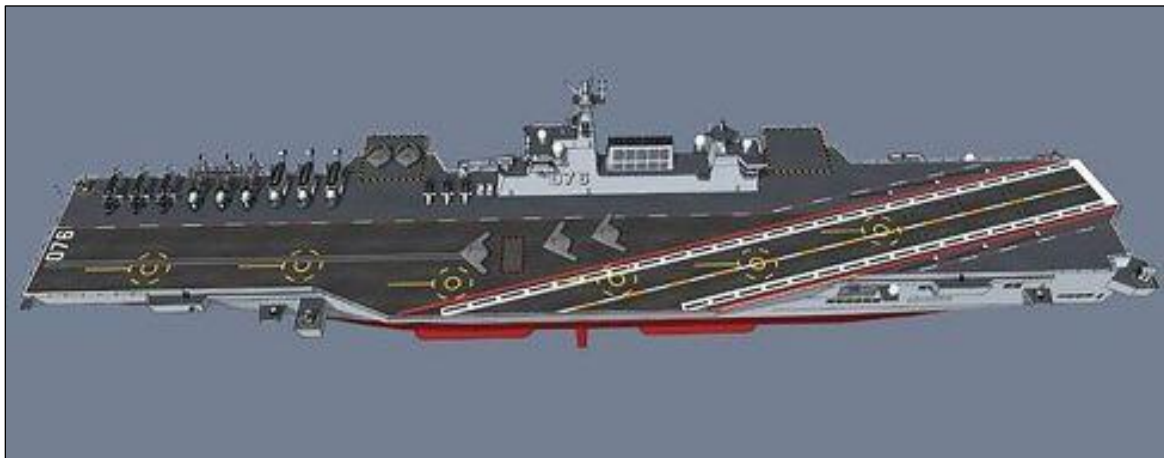
Figure 24. Notional Rendering of Possible Type 076 Amphibious Assault Ship

Source: Illustration accompanying Minnie Chan, "Chinese Shipbuilder Planning Advanced Amphibious Assault Ship," South China Morning Post , July 27 (updated July 28), 2020.